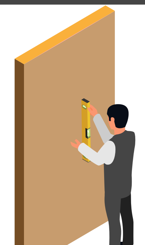
MARK THE WALL WITH A PLUMB/LEVEL LINE, TO SECURE A LEVELED START.