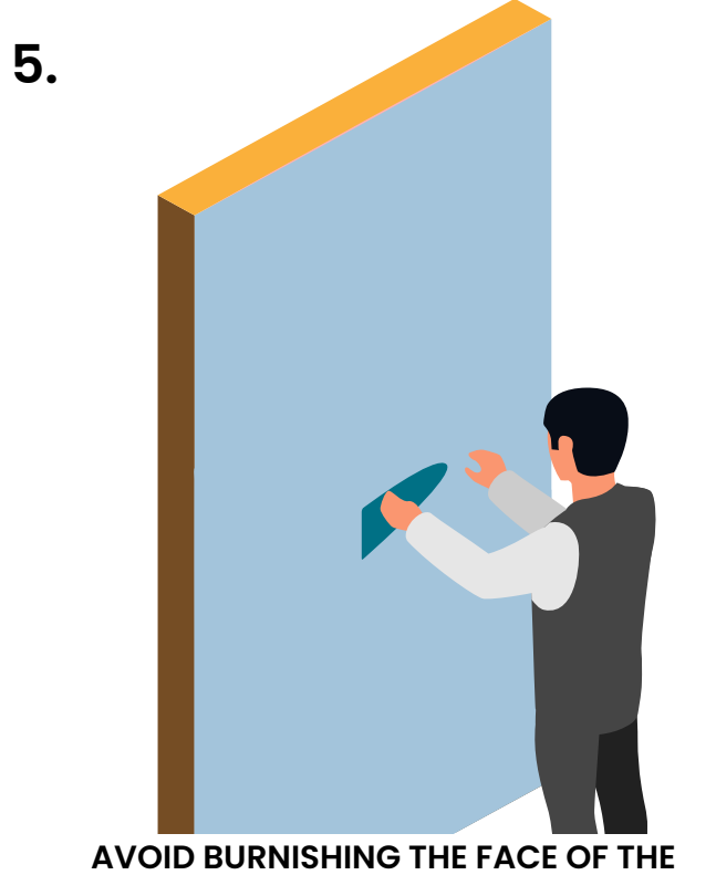
MATERIAL. USE A WALLCOVERING BRUSH OR A PLASTIC SCRAPER TO SMOOTH THE WALLPAPER ONTO THE WALL.