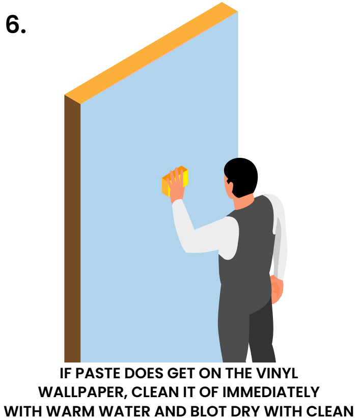
LINT FREE TOWEL. CHANGE THIS WATER FREQUENTLY.